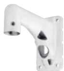
WV-QWL501-W Mount Bracket