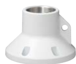
WV-QCL100-W Mount Bracket